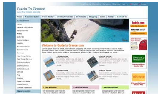
Portal Content Management, Online Bookings