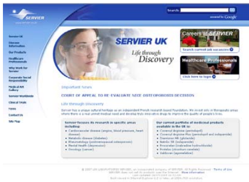
Organic SEO (search engine optimisation)